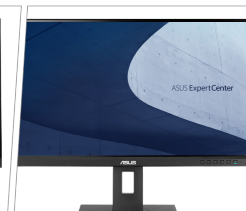
ASUS BE279CLB Business Monitor