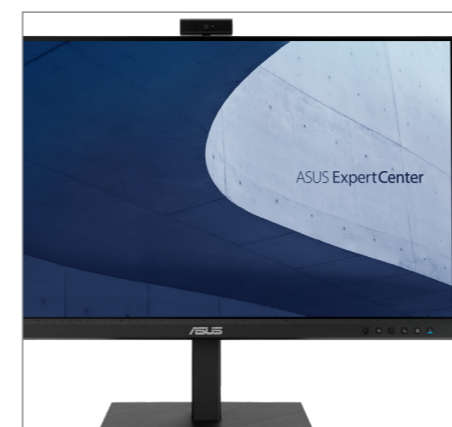
ASUS BE279QSK Video Conferencing Monitor